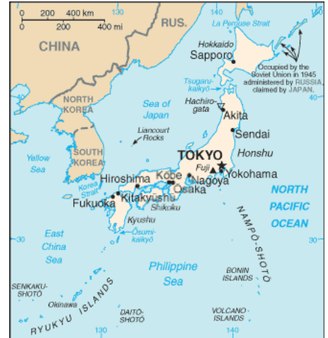
Map of Japan

Japan's four major and many smaller islands are spread out in a 2000-mile-long arc, but the extremely steep, forested terrain tends to limit settlement to narrow coastal plains and river valleys. Most crowded is the area from Kobe to Tokyo in the southern part of Honshu island. More than 50% of the people live there.